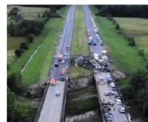
Butler County I-65 - 2021