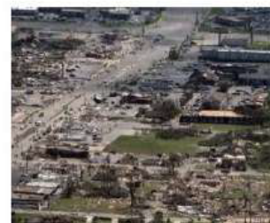
Tornados - 2011