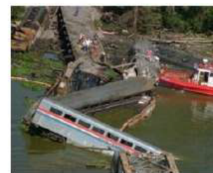
Amtrak Derailment - 1993